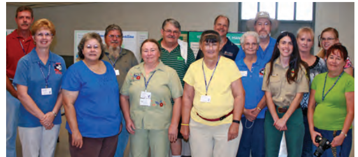
Bradford Master gardeners pose with Extension staff after working the Farm City Celebration luncheon.