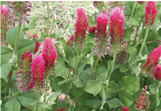
Crimson Clovers ( Trifolium incarnatum )