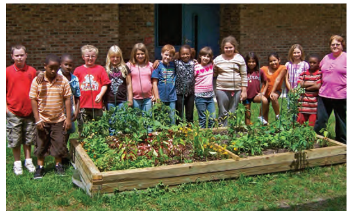
Starke Elementary students show off their vegetable and flower gardens.