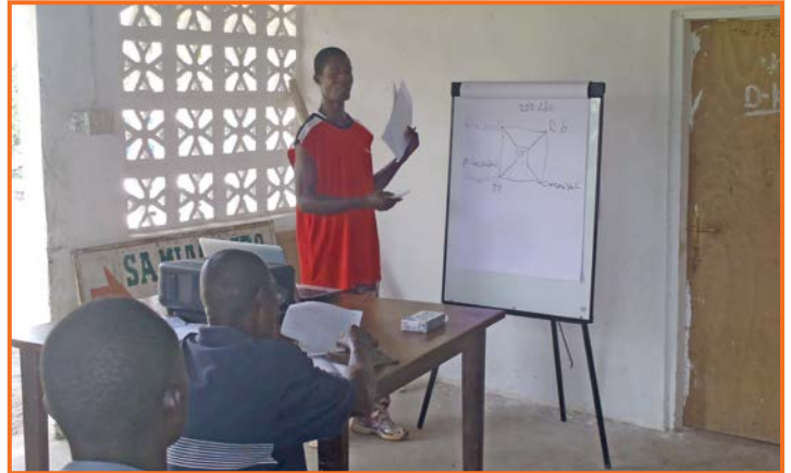
A pig farmer teaches his peers about what he has learned.

The rest of this assignment was focused on training. The pig producers were trained on selection of breeding stock, breeding, management during farrowing, pig nutrition, balancing simple rations using Pearson's Square and integrated management to control parasites. At the end of the training, all the producers reported an 80 percent increase in knowledge. In addition, I asked anyone in the class to teach on any topic that was learned during the sessions. The objective of this exercise was to reinforce what they had learned by listening to a local pig producer. There was one volunteer who demonstrated how to balance a simple ration using Pearson's Square. I believed that he would be an asset to other producers who may need help in balancing rations.