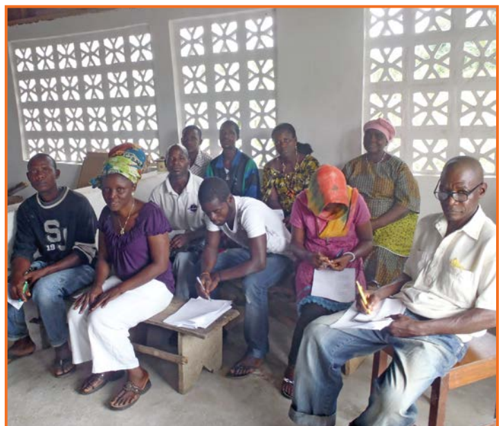
Pig farmers listening to a presentation on improved pork production.

I found out that the participants were enthusiastic and willing to learn new information which would assist them with their business. They were easy to teach merely by the interest they displayed during the teaching sessions. Volunteering in Liberia was a positive experience for me as I was instrumental in helping the participants to improve their situation by imparting valuable technical knowledge to them. I would encourage anyone to consider volunteering for one of these assignments.