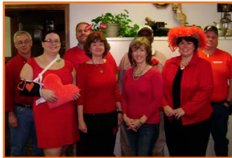
Lafayette County Extension Agents and Staff with FSA and Lafayette Conservation District Staff during Red Awareness Day.

Lafayette County was named in honor of the Marquis de Lafayette, the French citizen who rendered assistance to the colonies during the American Revolutionary War. Lafayette County is the second least populous county in Florida only to Liberty County. The Census in 2010 showed Lafayette County